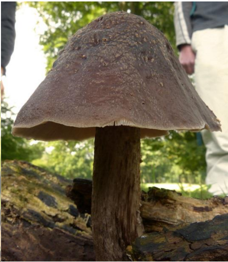
Even larger fungi